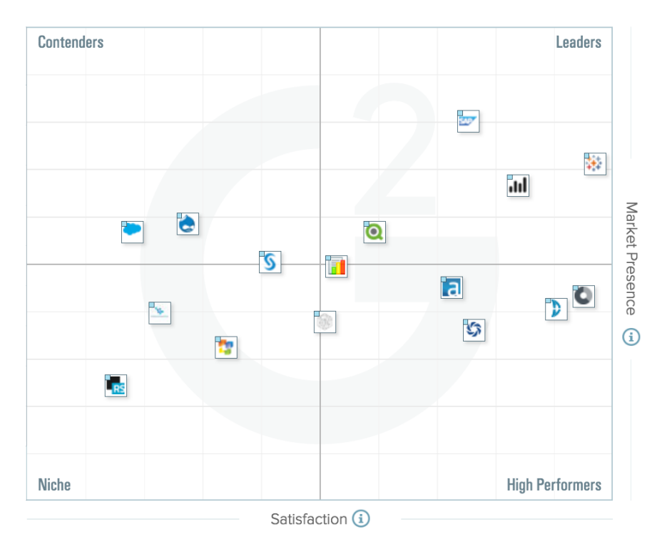
A Snapshot of the current Self-Service Business Intelligence Software.

According to G2 Crowd, "the Grid™ represents the democratic voice of real software users, rather than the subjective opinion of one analyst. G2 Crowd rates self-service business intelligence products algorithmically based on data sourced from product reviews shared by G2 Crowd users and data aggregated from online sources and social networks."